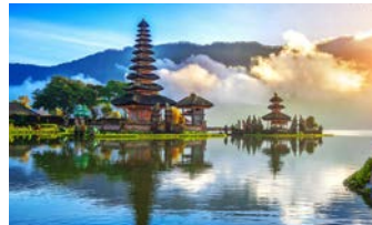
BALI LUXURY ESCAPE PLUS $10,000 CASH