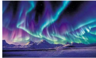
NORDIC NORTHERN LIGHTS EXPERIENCE PLUS $10,000 CASH