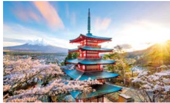
JAPAN CHERRY BLOSSOM ODYSSEY PLUS $10,000 CASH