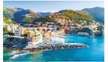
ITALY UNDER THE TUSCAN SUN PLUS $10,000 CASH