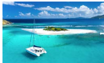
BRITISH VIRGIN ISLANDS PLUS $10,000 CASH