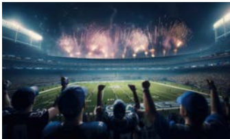
SUPERBOWL 2025 IN NEW ORLEANS PLUS $10,000 CASH