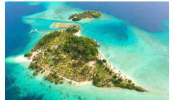
PRIVATE ISLAND PARADISE AT NECKER ISLAND PLUS $10,000 CASH