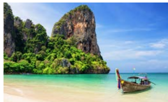
THAILAND & JAMES BOND ISLAND PLUS $10,000 CASH