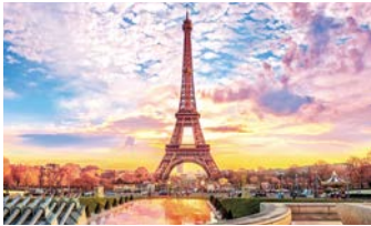
PARIS ART & FOOD EXPERIENCE PLUS $10,000 CASH

Introducing Wanderlist, where 20 winners will each choose one of 10 exclusive, once in a lifetime vacations. Each vacation is valued at $70,000 plus you will get $10,000 Cash OR take $80,000 Cash instead.