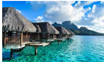
BORA BORA ESCAPE PLUS $10,000 CASH